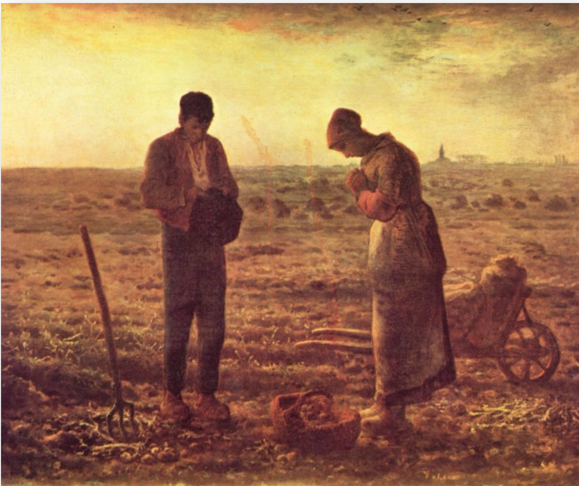
The Angelus by Millet - Oil on Canvas

O Light, that followest all my way, I yield my flickering torch to Thee; My heart restores its borrowed ray, That in Thy sunshine's blaze its day May brighter, fairer be.